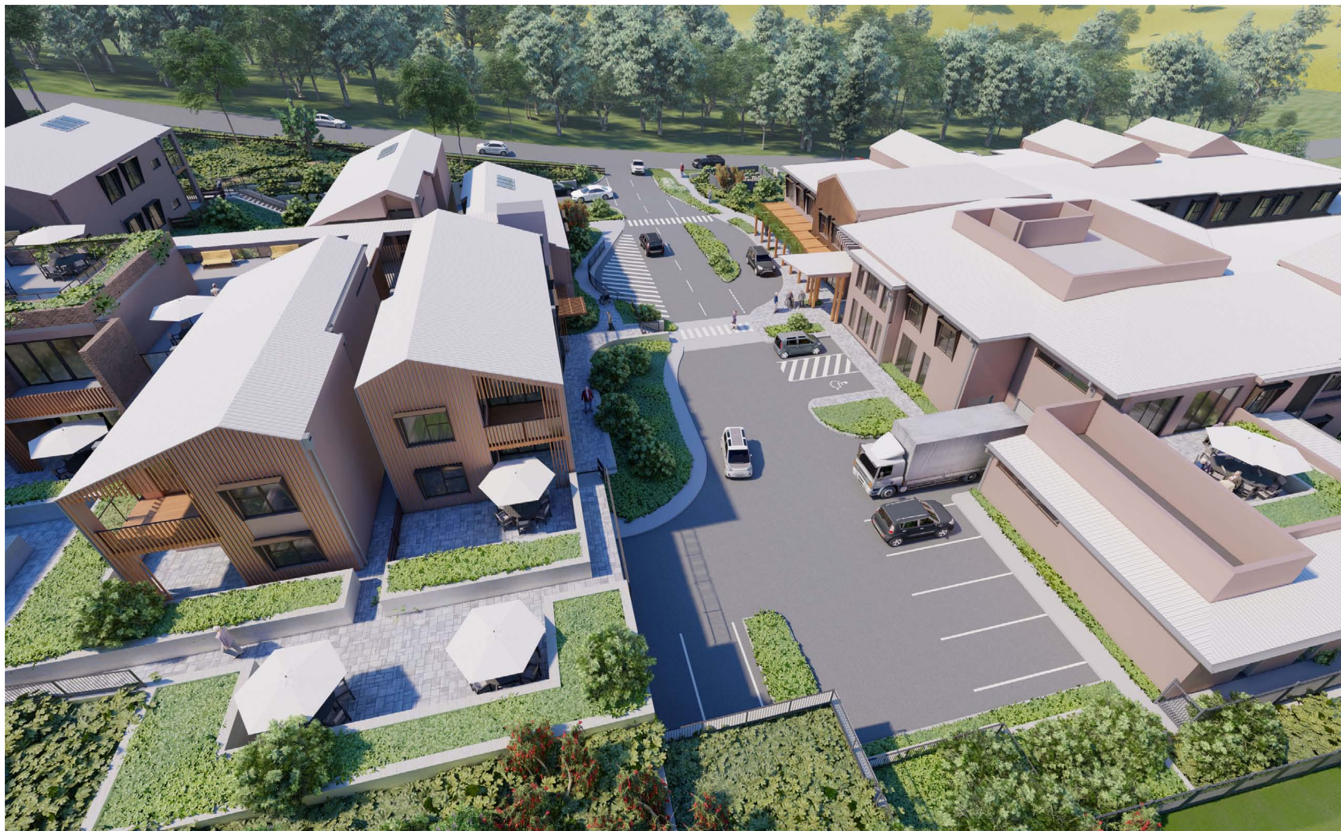
Overview - Entry to the RACF and the Lower ILUs