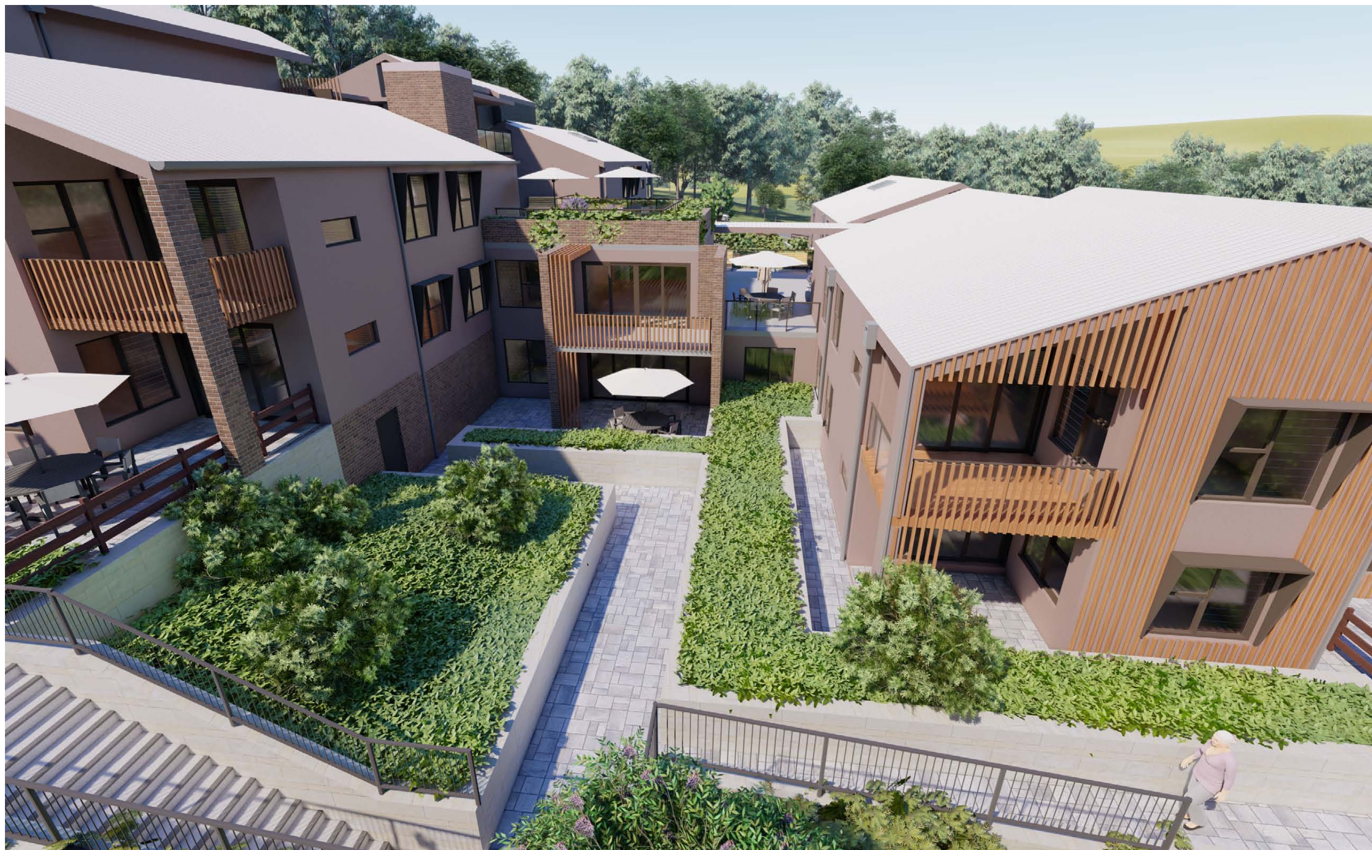
Northern Side Passage Walkway and Revegetation Buffer between the ILUs & Adjoining Property