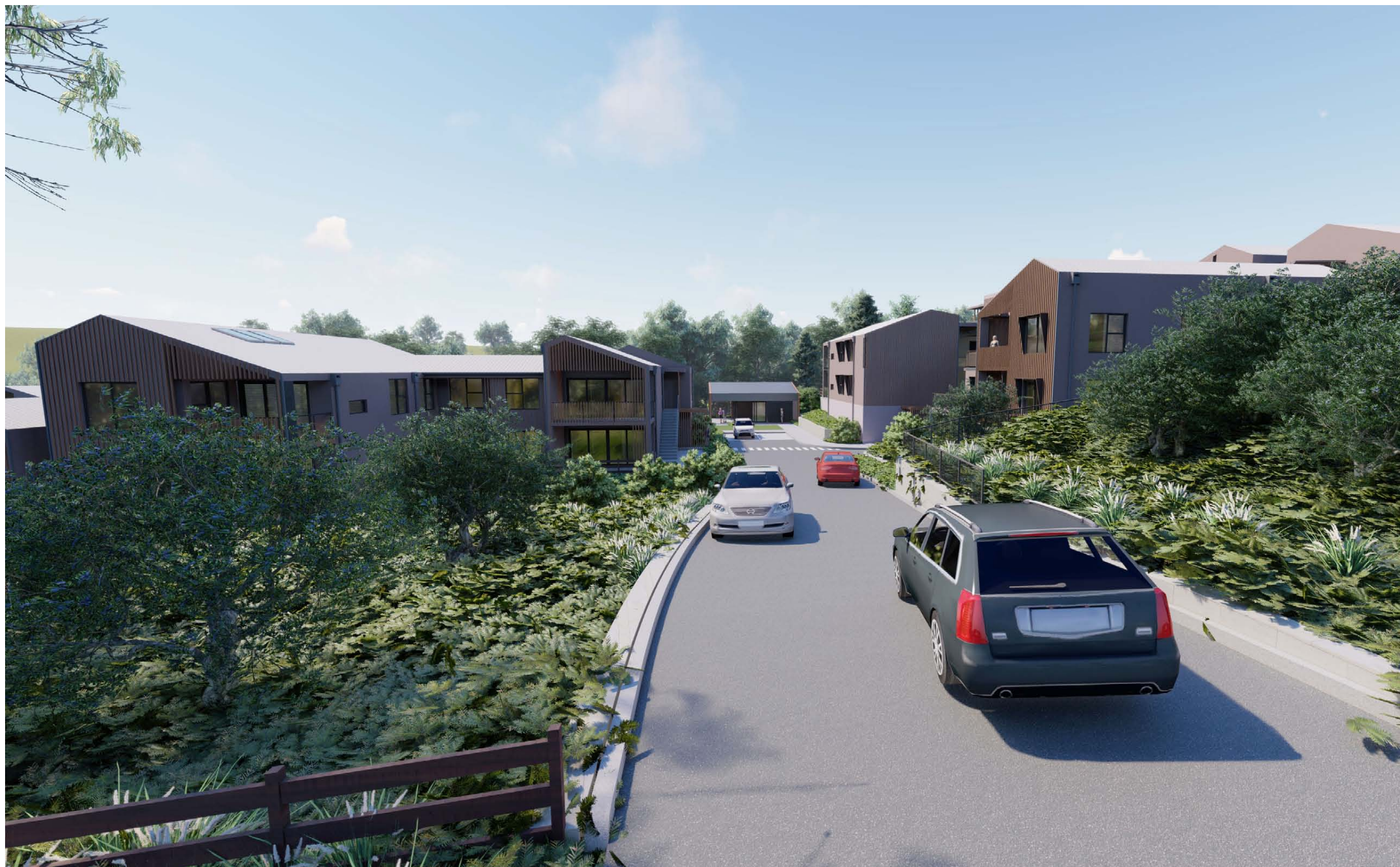
Eastern Driveway Entry to ILUs