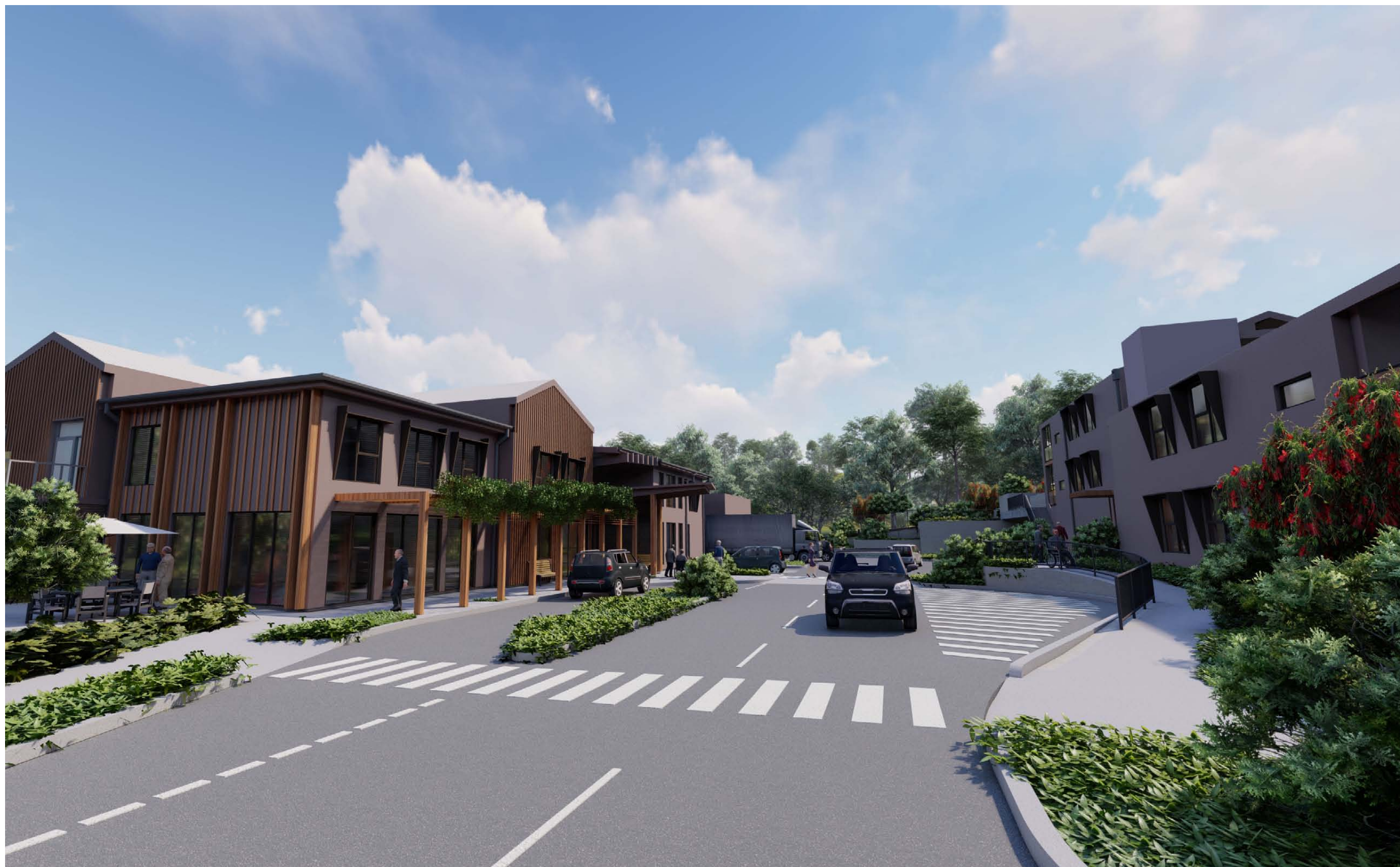
View to RACF Entry Drop off Zone from Internal Driveway