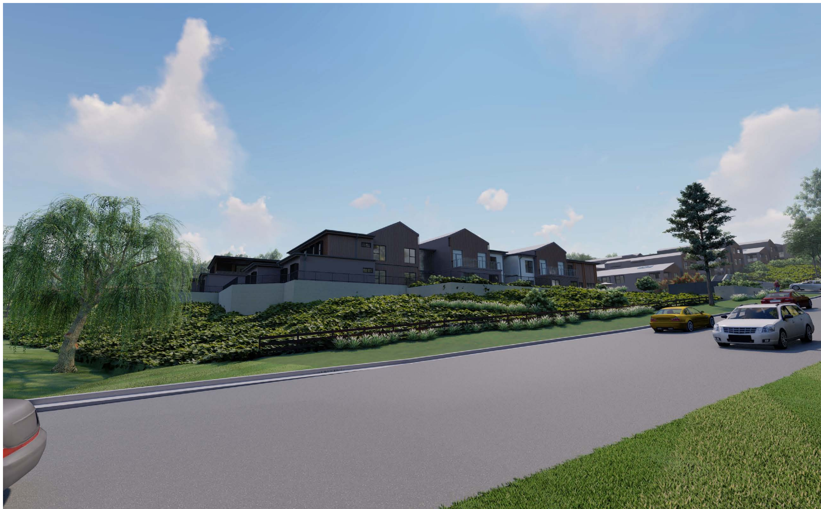
View to RACF from Cooyong Road at SW Corner of Site