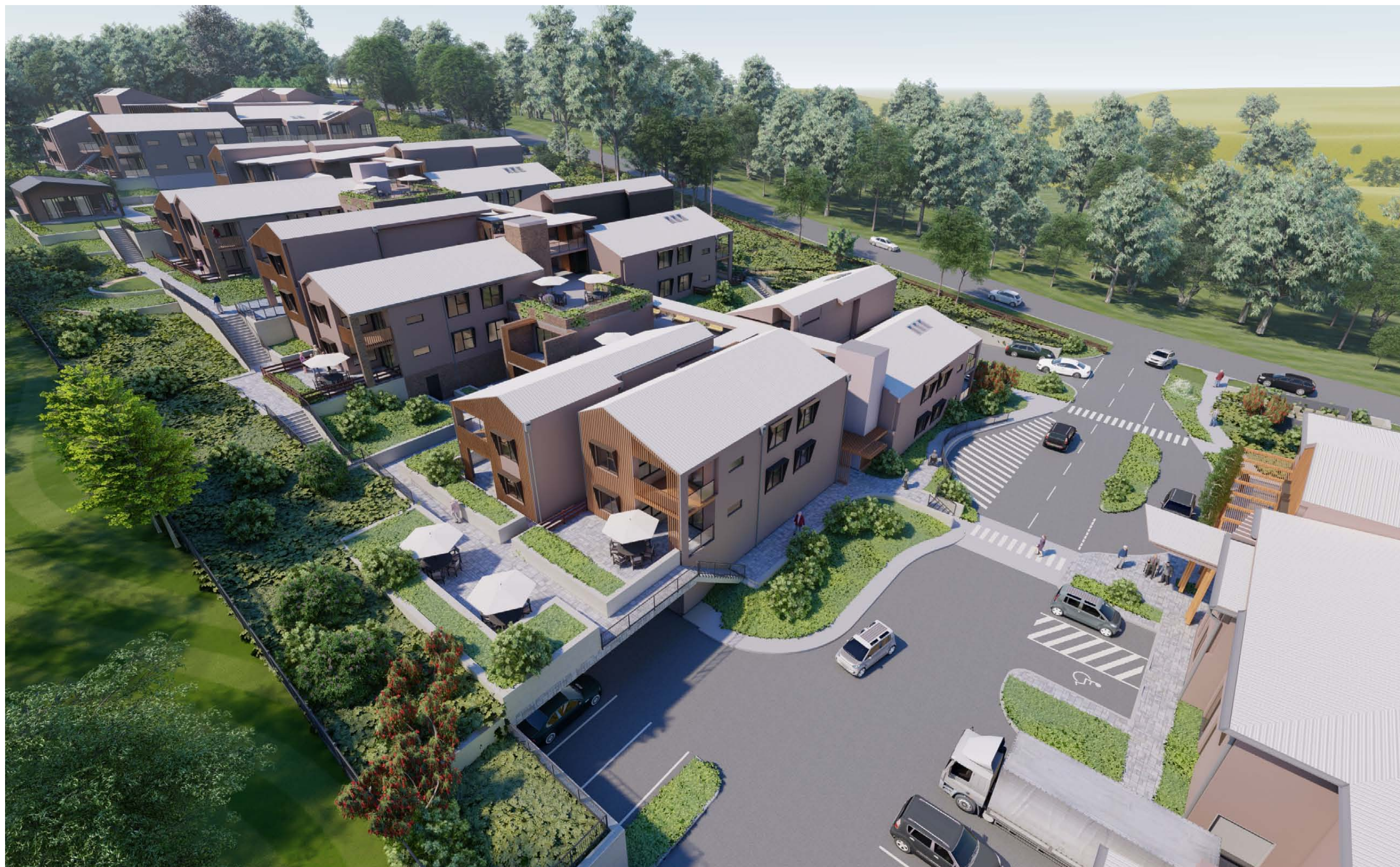
Overview - Looking South East Over ILUs