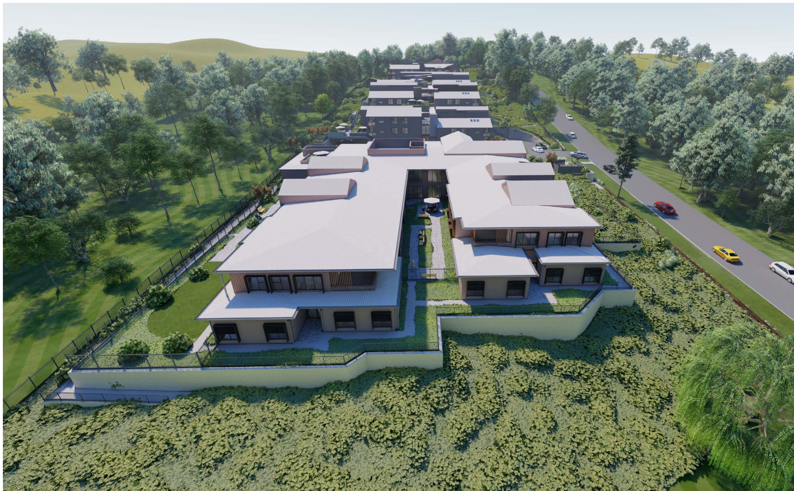
Overview - Looking North East with the RACF in the Foreground and the ILUs Beyond