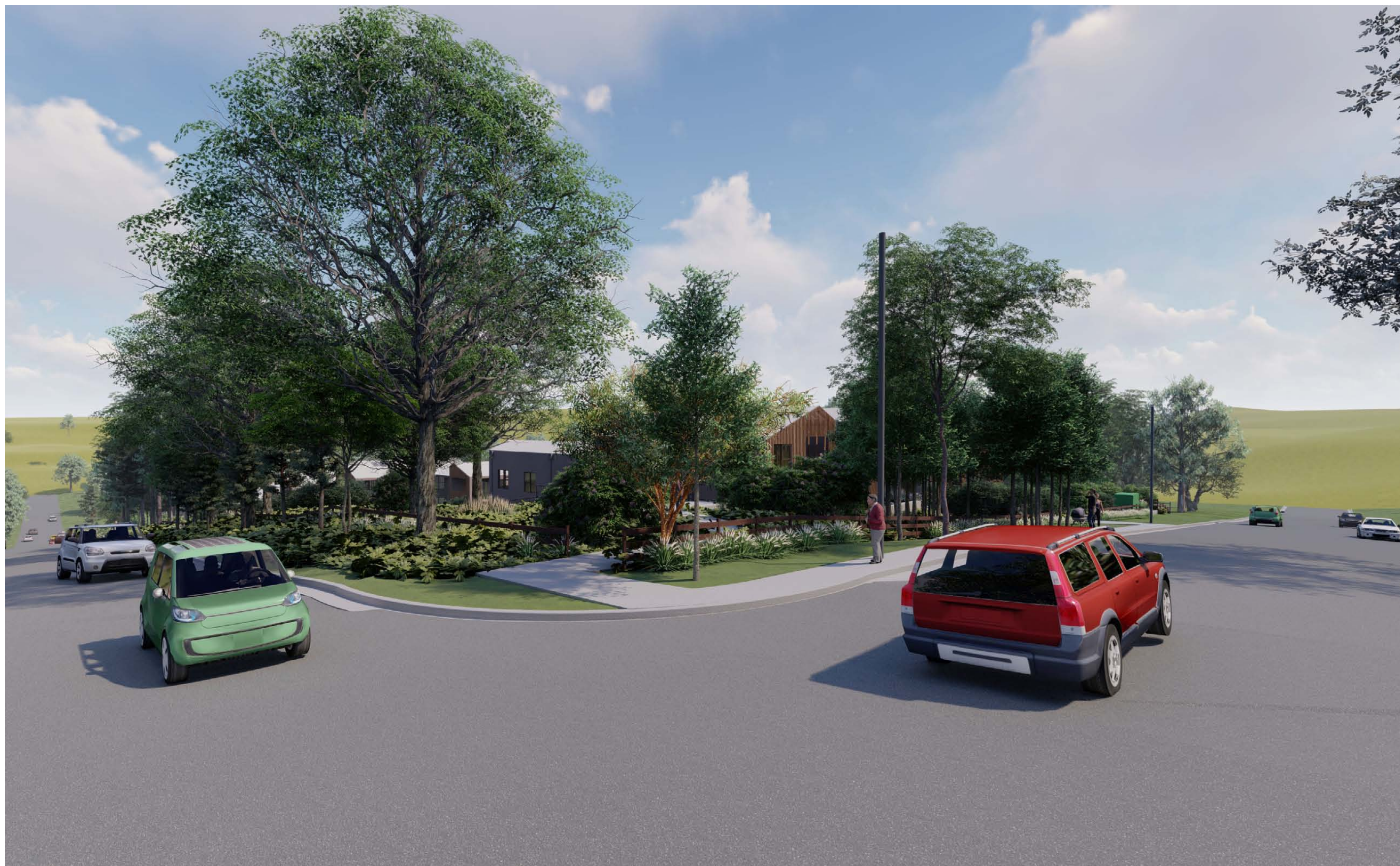
View to ILUs from Cooyong Road & Laitoki Road Intersection in SE Corner of Site