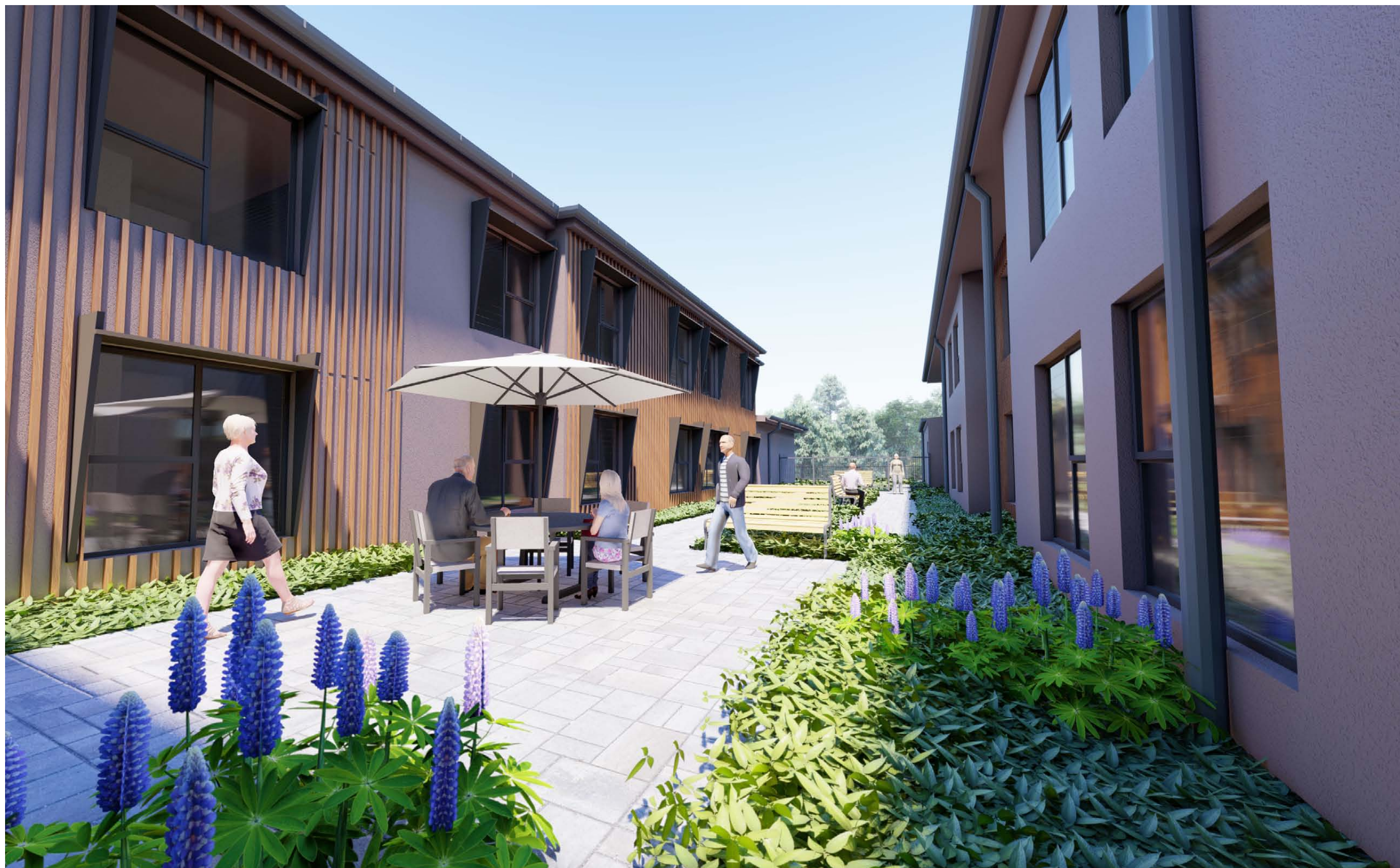
RACF Central Secure - Dementia Courtyard