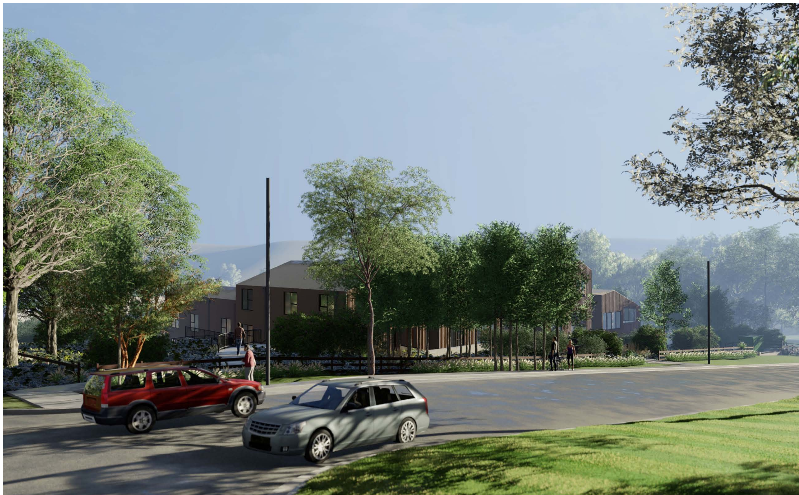
Detailed eye-level view along Laitoki Road frontage from the intersection with Cooyong Road looking north-west