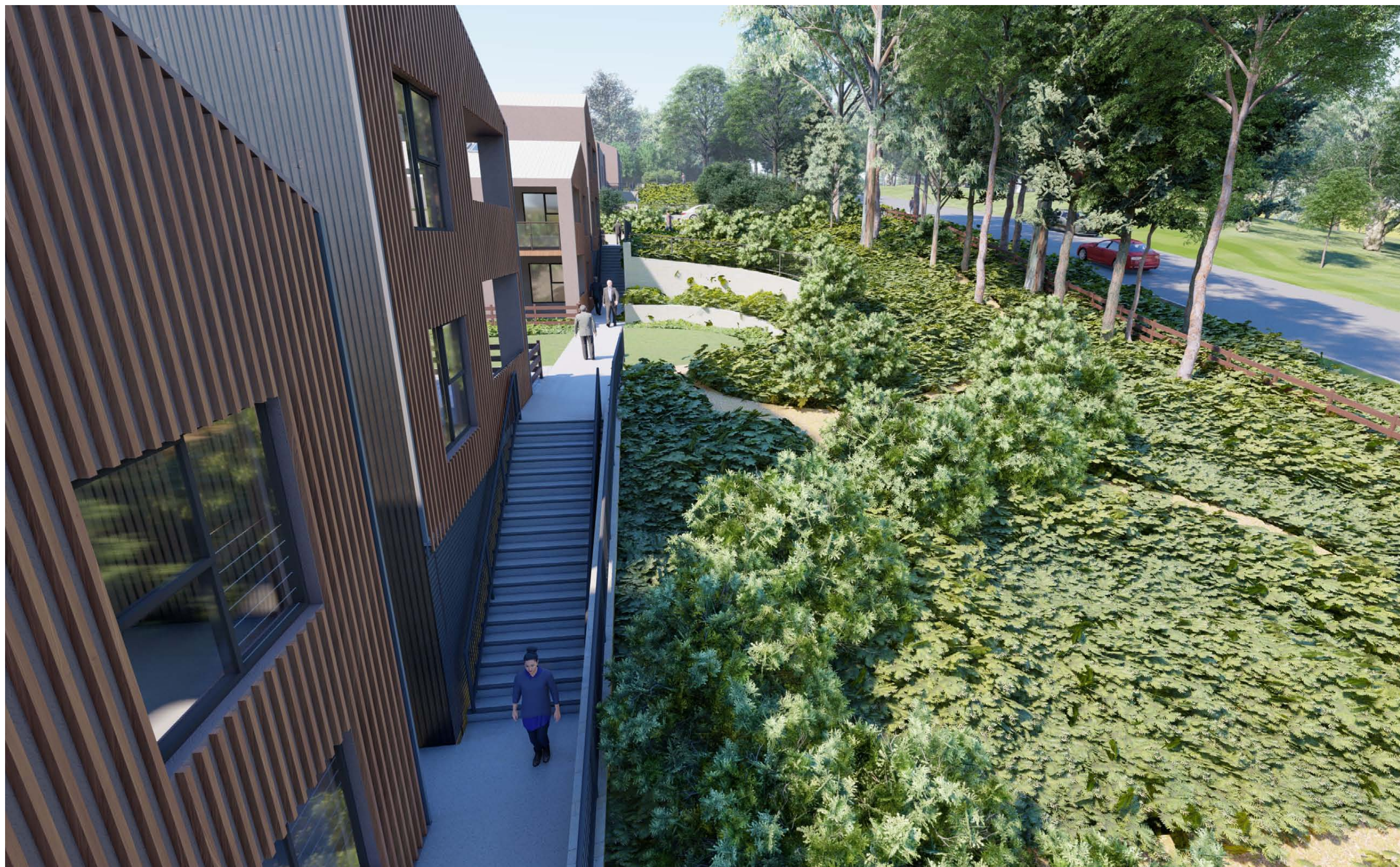
Southern Side Passage Walkway and Revegetation Buffer between the ILUs & Cooyong Rd