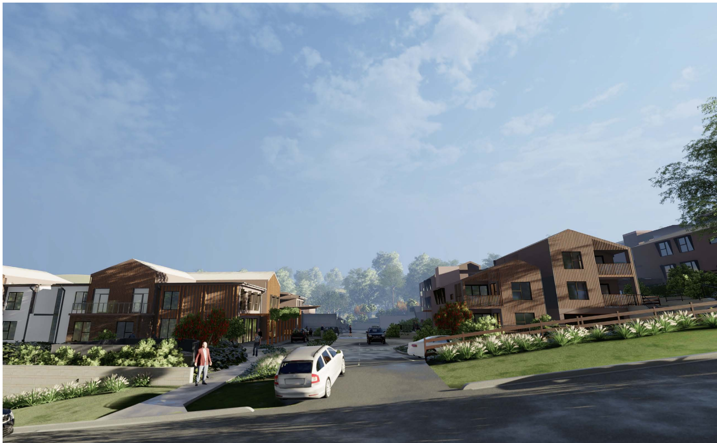
Western Driveway Entry to the RACF and the Western ILUs off Cooyong Road