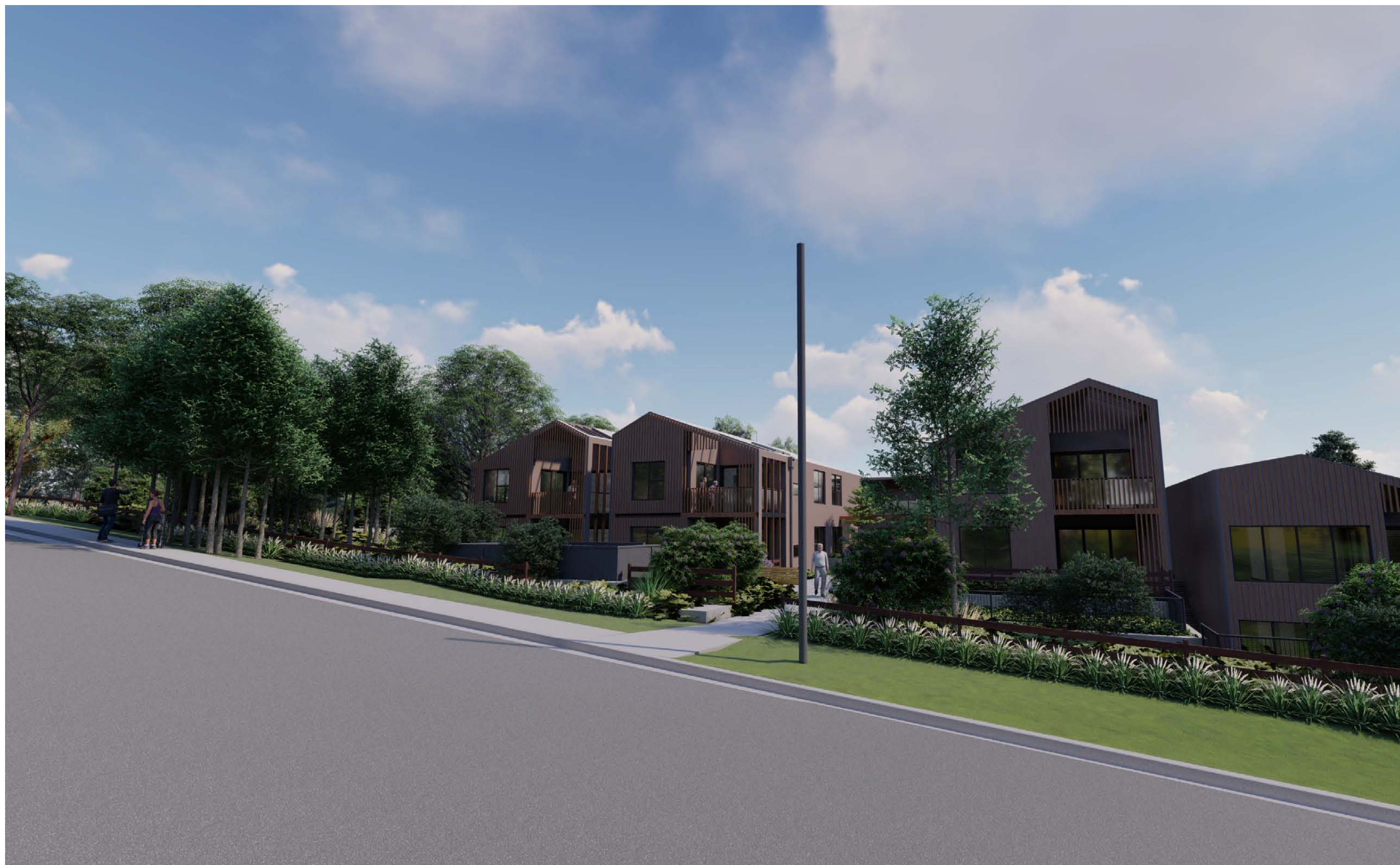
Laitoki Road Eastern Elevation and Pedestrian Connection