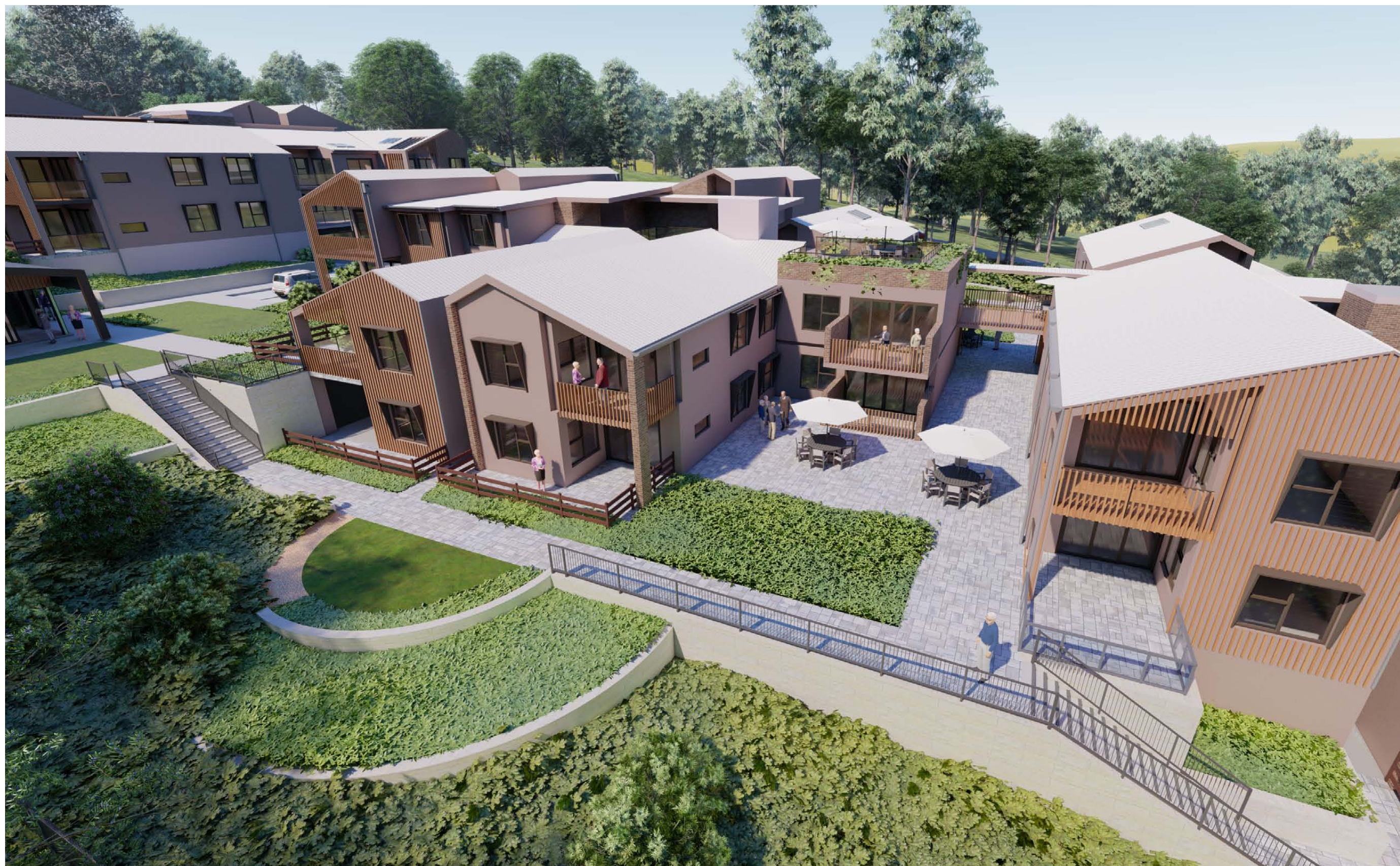
Side Passage and Courtyards to North of the ILUs